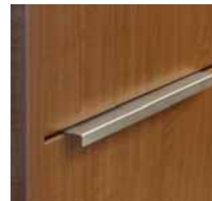
The look of the pulls integrates with the other hardware.