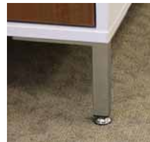
TeamWorx Cargo Hubs rest on 5" steel legs.

TeamWorx unique flexibility is based around Cargo Hubs, which act as a container for different storage inserts. Cargo Hubs can be ordered in various sizes, and the 16 different types of inserts [such as box-file pedestals, lateral pedestals, bookcases, and storage cabinets] can be easily reconfigured in the field.