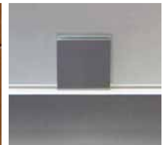
Steel clips secure glass, acrylic, and laminate privacy panels to worksurfaces and spinewalls.